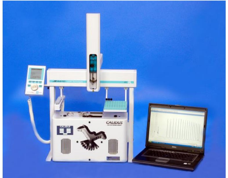
CALIDUS™ GC with optional autosampler and laptop interface.

FASTER – With analytical cycles 10 to 50 times faster than traditional gas chromatography, the CALIDUS™ GC vastly increases responsiveness for the data consumer. Less time spent waiting on results means more productivity and timely control of the measured process. In the hands of lab and process managers, the speed of the CALIDUS GC can translate into better quality products, produced faster and more profitably than ever before.